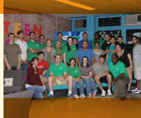
Employees gathered at a Chicagoland Boys & Girls Club.

Increased employee engagement Strengthened company's reputation