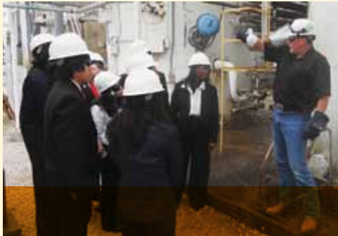
Top: Texas high school students learned more about careers in STEM fields after touring the Praxair plant in Garland.