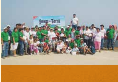
Top: Employees at the plant at Sahagún gather during the Global Earth Day Celebration.