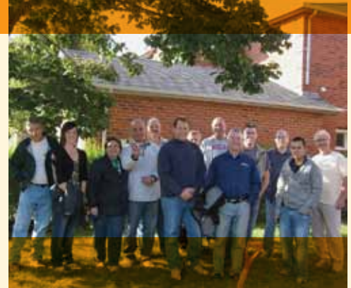
Praxair Canada employees are all smiles after rehabilitating a foster home for the Peel Children's Aid Foundation.

"It was rewarding to know that our efforts were ultimately for the benefit of children truly in need of a secure and warm place to call 'home.' We could see the direct impact of our work, and that motivated our group to put in a 110 percent effort."