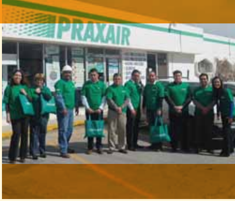
Praxair Mexico employees provided 2,000 food baskets for drought victims in Chihuahua.