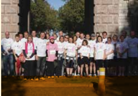
Top: Praxair employees in Madrid celebrate one more step in the fight against breast cancer.