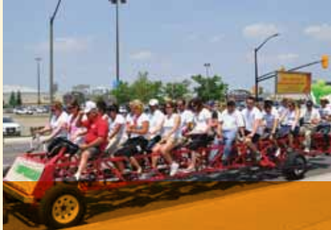
Top: The Praxair Canada team raised more than $5,000 for the Heart & Stroke Foundation at the Big Bike Ride in June 2012.