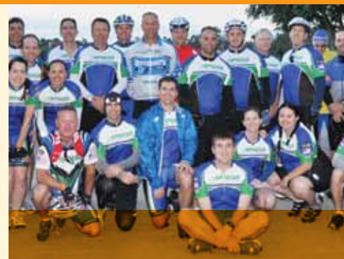
The Sierra Pines team rode over 100 miles to support the National Multiple Sclerosis Society.

Increased employee engagement Increased customer engagement