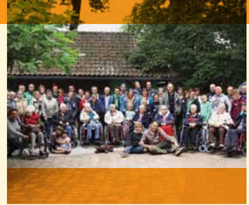
Top: Belgium employees and residents of De Troon gather for a group picture at the conclusion of their trip to the zoo. The site is planning additional activities with the residents.

Increased employee engagement Strengthened company's reputation